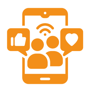
Use of social media